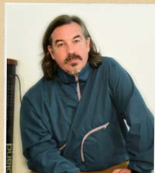
DUNCAN SHEIK Composer

Recordings include; Claptrap (2022) American Psycho Original London Cast Recording (2016), Legerdemain (2015) Covers 80s (Sneaky Records 2011), Whisper House (Sony 2009), Spring Awakening (Original Broadway Cast Recording) (2006), White Limousine (Rounder 2006), Daylight (Atlantic Records 2002), Phantom Moon (Nonesuch 2001), Humming (Atlantic Records 1998), Duncan Sheik (Atlantic Records 1996).