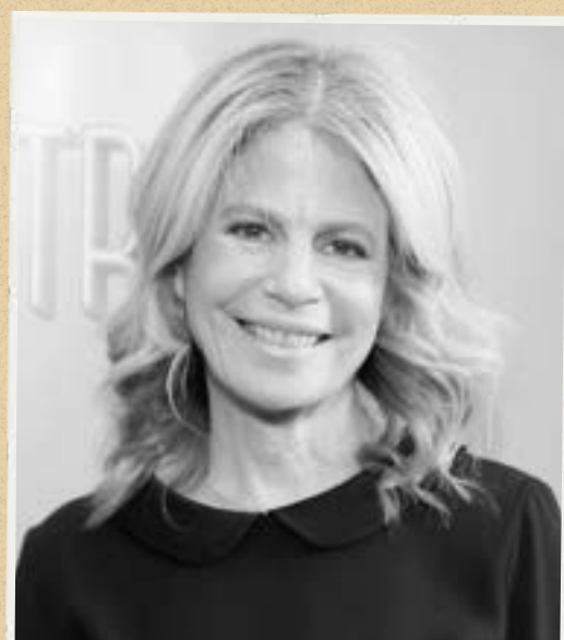
JESSIE NELSON Author

Jessie Nelson wrote the musical Waitress with music and lyrics by Sara Bareilles. The show played on Broadway for 4 years and moved to the West End in London. Sara and Jessie went on to create the show Little Voice which they Executive Produced with JJ Abrams for Apple TV. Jessie wrote, directed and produced Corrina Corrina and I Am Sam starring Sean Penn, who received an Academy Award nomination for his performance. Among her other directing credits are Curb Your Enthusiasm and Love, the Coopers with Diane Keaton. Her writing credits include Step Mom and The Story of Us. She produced Fred Claus and Danny Collins. In London, Jessie directed Alice By Heart which she co-wrote with Steven Sater with music by Duncan Sheik at the National Theater Connections Program and again at MCC in NYC. She began her career as an actress at the Public Theater working with the award-winning experimental theater Mabou Mines and at the New York Shakespeare Festival. She wrote the children's book Labracadabra. She has been the artistic Director of the Sundance Screen Writers Lab.